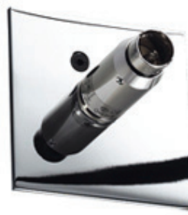
MUNIQ - WALL RECESSED