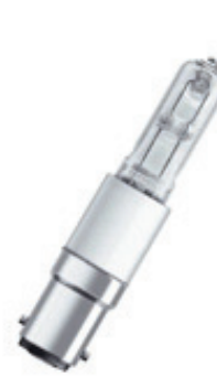
BULB QT18 B15D