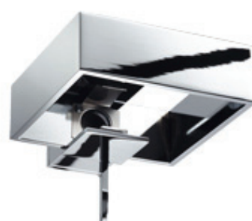
MUNIQ - LUMINAIRE HEAD

This product can be adapted to your personal requirements by means of a comprehensive program of equipments.