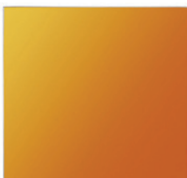
GLASS DICRO ORANGE

This product can be adapted to your personal requirements by means of a comprehensive program of equipments.