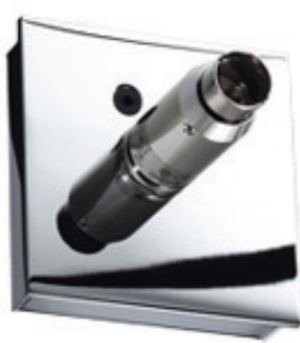
MUNIQ - WALL