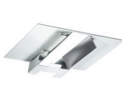
MUNIQ / REFLECTOR